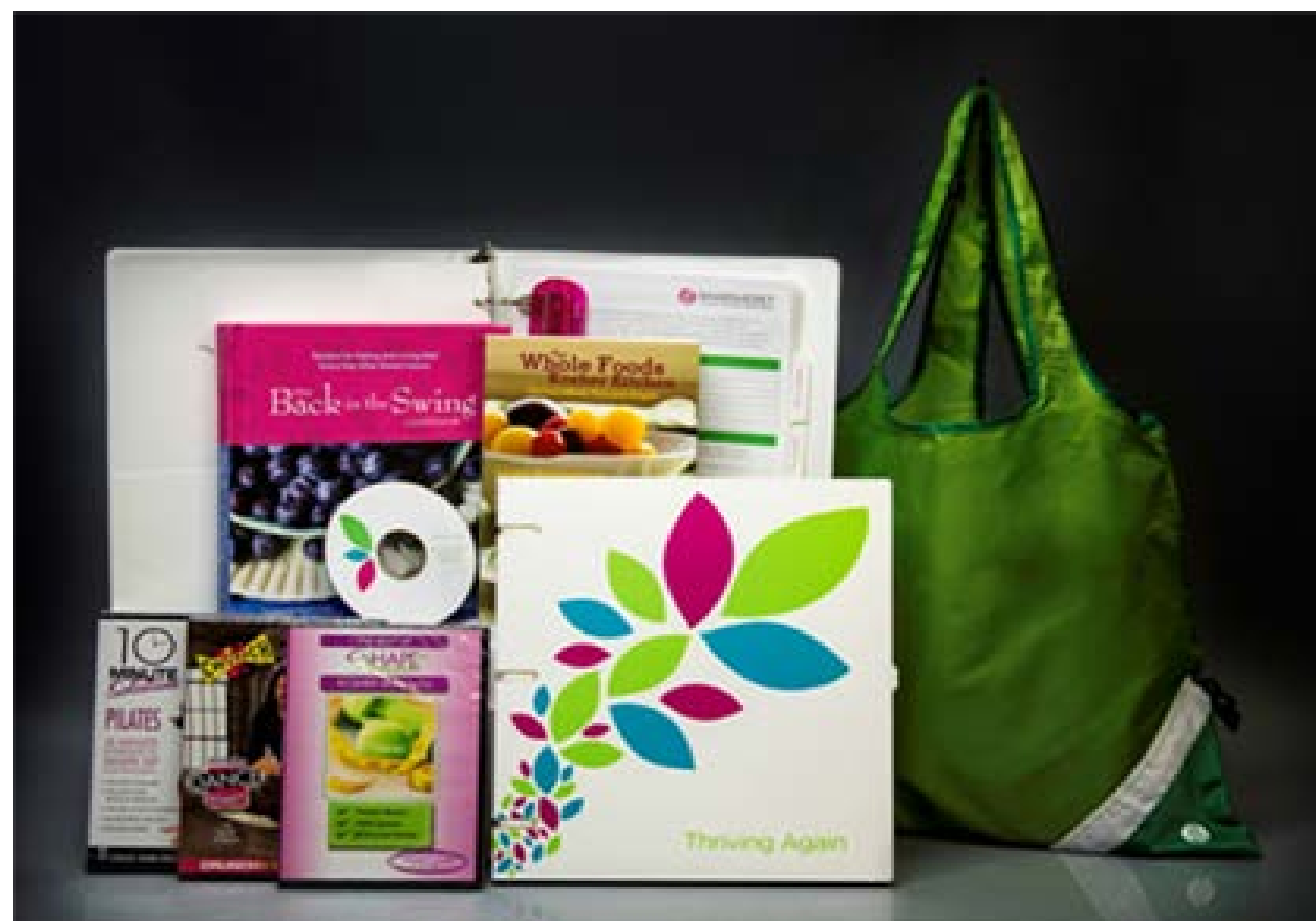
Exhibit A: Thriving Again® Survivorship Kit

The purpose of this study was to describe a community-based resource for Jewish YBCS and to examine women's engagement and satisfaction with the resource components.