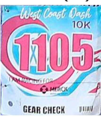
RACE BIB (FAMILY FUN RACE)