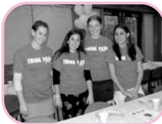
Sharsheret on Campus page 7