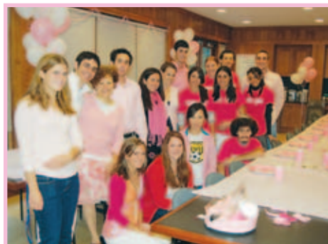
Trinity College Hillel students (Hartford, Connecticut) prepare for their Breast Cancer Awareness Pink Shabbat.