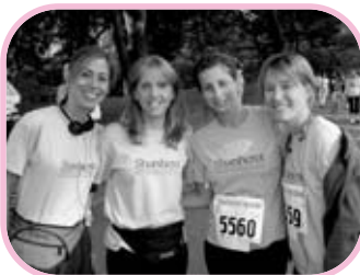
Team Sharsheret page 6