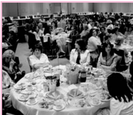
More than 400 women and men celebrated life and loved ones at Sharsheret's Annual Benefit Luncheon.