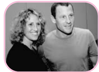
Reaching Out page 4