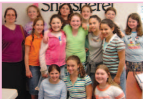
Students from the Adolph Schreiber Hebrew Academy of Rockland (Monsey, New York) visit Sharsheret and present donations collected from their class Bat Mitzvah project.