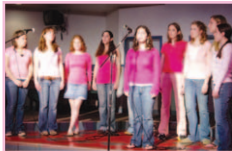
Muhlenberg College Hillel students (Allentown, Pennsylvania) host a Breast Cancer Awareness Concert in support of Sharsheret.

Sharsheret is reaching out to high school and college students across the country in an effort to raise awareness about breast cancer. Educating college students about breast health and the impact of breast cancer on Jewish women will help save lives, as young women learn about the importance of early detection. For more information and to bring Sharsheret to your high school, Hillel House, or college campus, call toll-free (866) 474-2774.