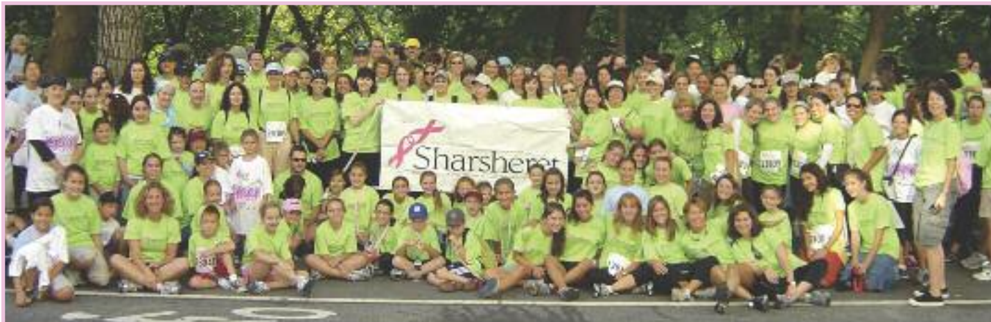
Team Sharsheret at New York City's Race For The Cure in Central Park.