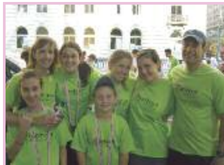
The Forman Family of Teaneck, New Jersey.