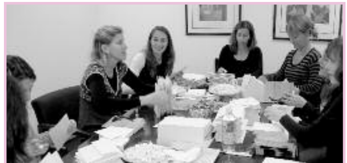
Sharsheret volunteers working together at the Sharsheret office.

For more information about Sharsheret volunteer opportunities in your area, call toll-free (866) 474-2774 or e-mail info@sharsheret.org .