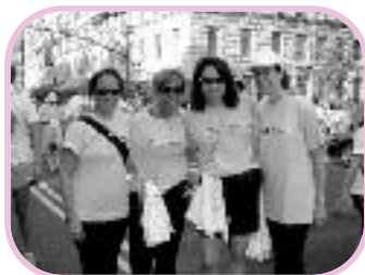
Team Sharsheret page 7