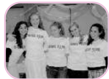
Sharsheret On Campus page 9