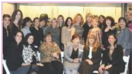
Chanukah Fashion and Gift Show Committee.

in fashion and gift-giving from the experts at Neiman Marcus, just in time for Chanukah shopping. For more information about coordinating a Sharsheret fundraising event in your community, call toll-free (866) 474-2774 or e-mail events@sharsheret.org.