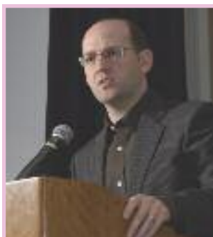
Best-selling author Brad Meltzer addresses luncheon guests.