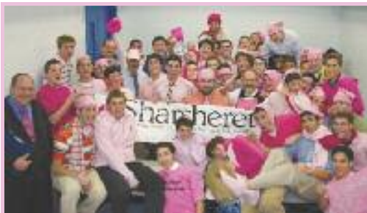
Torah Academy of Bergen County high school students participated in "Real Men Wear Pink Day" to raise breast cancer awareness and support for Sharsheret's programs.