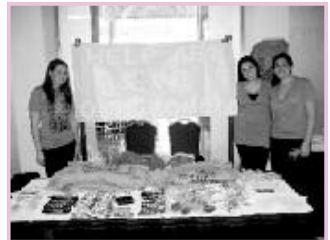
George Washington University AEPHI sorority hosted a denim and t-shirt sale to benefit Sharsheret in Washington, D.C.