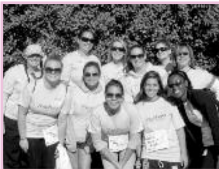
Fairleigh Dickenson AEPHI sorority created Team Sharsheret at the Leonia, New Jersey Breast Cancer Walk.