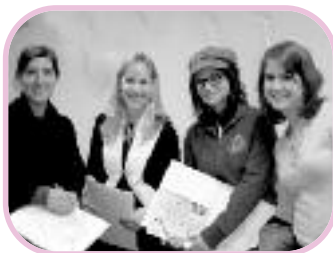
Sharsheret Volunteer Program page 8