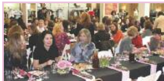
Chanukah Fashion and Gift Show guests.