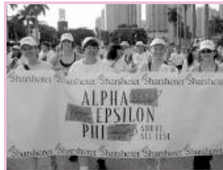
Team Sharsheret at the Susan G. Komen Race For The Cure in Miami, Florida.