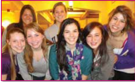
Student leaders at the University of Illinois Urbana-Champaign bring "Have The Talk" to their campus.