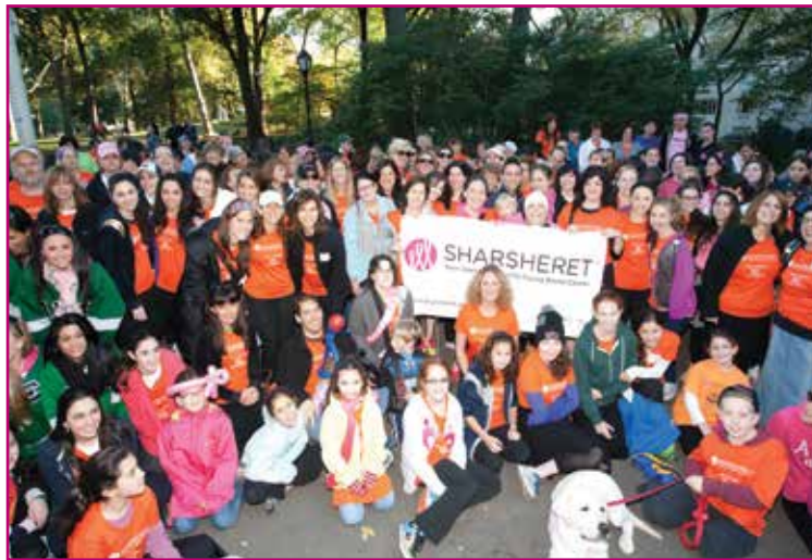
More than 400 women, men, children, and college students joined Team Sharsheret at the Making Strides Against Breast Cancer Walk in NYC's Central Park.