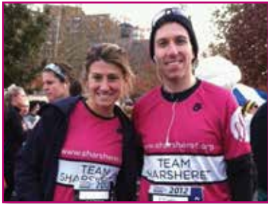
Race With Team Sharsheret page 6