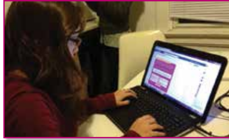
A Rutgers University student takes the online pledge to "Have The Talk".