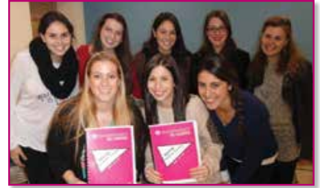
Boston University students participate in a Sharsheret on Campus Leadership Training seminar.