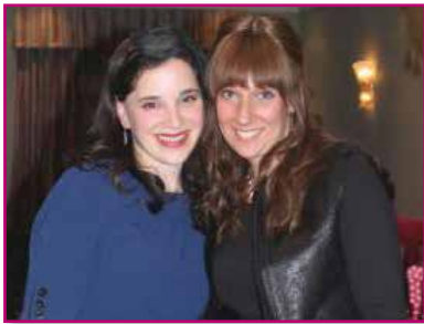
In Your Community page 7