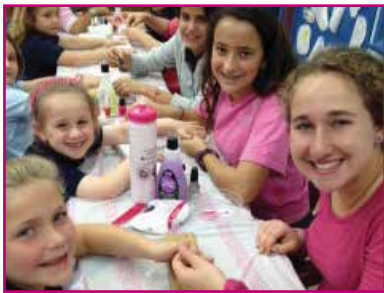
The Next Generation page 11