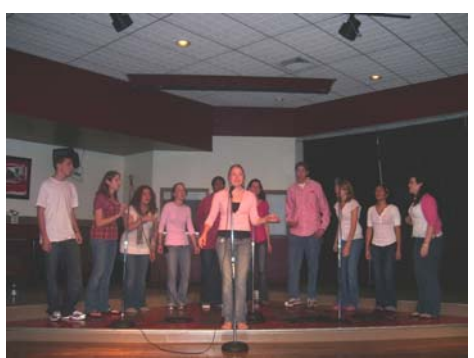
Muhlenberg College A Cappella Concert.