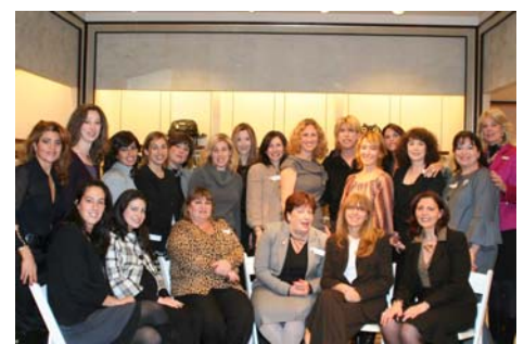
Chanukah Fashion and Gift Show Committee.

Sharsheret celebrated Chanukah 5768 as more than 150 women from Bergen County, Riverdale, Westchester and New York attended Sharsheret's sold-out Chanukah Fashion and Gift Show Luncheon, Tuesday, November 27, 2007 at Neiman Marcus in Paramus, New Jersey. The Chanukah Fashion and Gift show highlighted the newest trends in fashion and gift giving from the experts at Neiman Marcus, just in time for Chanukah shopping. The Chanukah Fashion and Gift Show was a great opportunity for Sharsheret to meet the women we serve and our dedicated supporters.