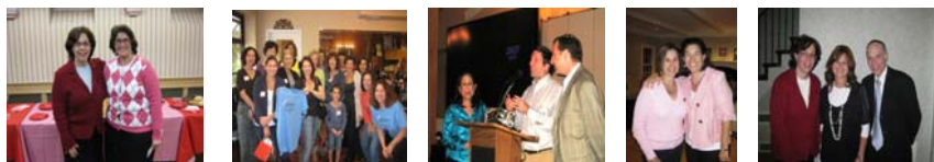
From Left to Right, Brooklyn Parlor Meeting, Sisterhood of Congregation Beth El-Ner Tamid, Memphis Parlor Meeting, Milwaukee Parlor Meeting, Passaic Parlor Meeting.